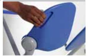
Built-in Seat Hand grips

Hand grips integrated in the seat allow the caregiver to easily turn the support aid