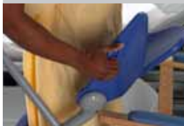
New Seat Design

The innovative pivoting seat improves transfer efficiency and resident/patient stability