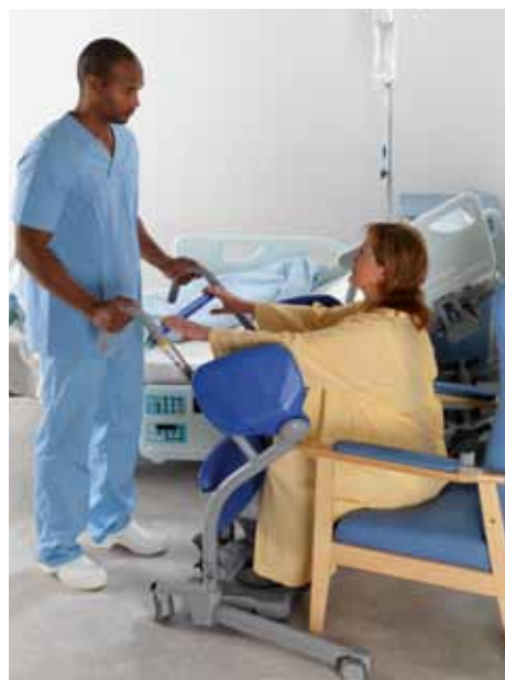
Approach the resident/patient, open seat flaps, open chassis legs and place the resident's/patient's feet on the footboard