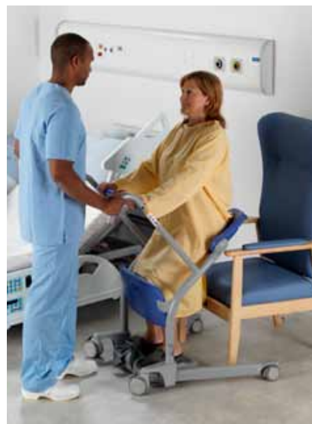
Release the brakes and proceed with the transfer