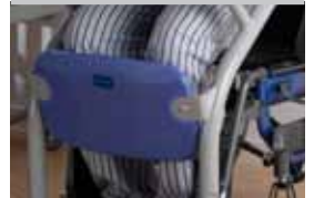
Better Knee Support

Provides extra stability and firm support when a resident/patient cannot fully control leg movements