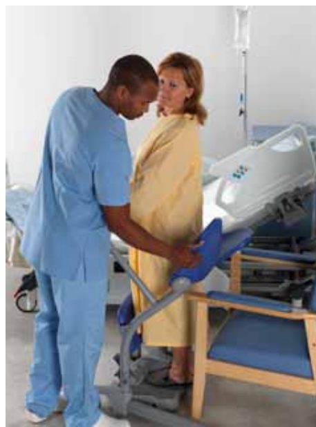
Position the Sara Stedy ; apply castor brakes; raise the resident/patient with the help of the integrated handlebar; swivel the seat flaps into position